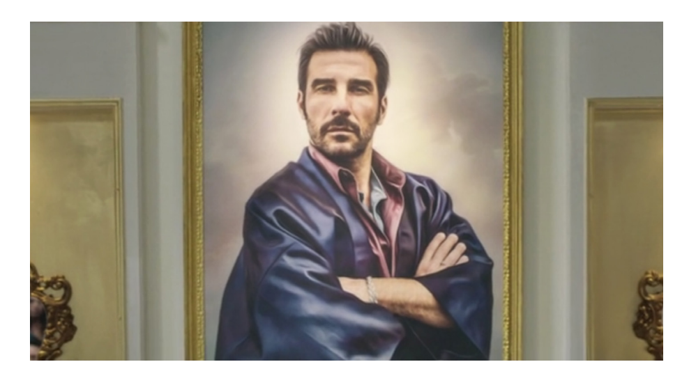
Figure 2. Final frame from the movie Just Believe (Aronadio 2018)