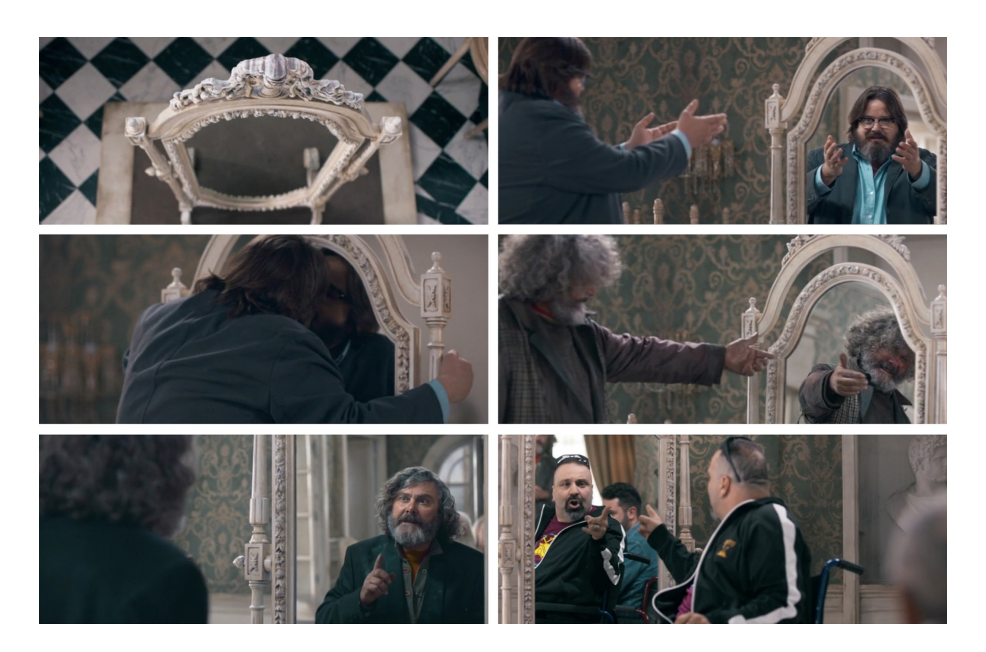
Figure 1. Frames from the movie Just Believe (Aronadio 2018).

Drawing on a conception of conversion as an act of communication (in the sense described by Leone 2007), therefore, we could describe Milos' "change of direction" (as the etymology<sup>7</sup> of the term suggests) as a "paradoxical" experience, based on the coexistence of both difference and similarity, otherness and identity, change and continuity (cf. Leone 2002). In this sense, the mirror plays a crucial role, since – according to what Lotman (1988) highlighted in his famous essay on the semiotics of mirrors and specularity<sup>8</sup> – it both reflects and inverts the man's image, thus functioning as an instrument of sameness and difference at the same time, namely as a "threshold" device (cf. Eco 1985: 12). In fact, as Milos clarifies shortly after, talking to himself (while always looking at his reflected image, see fig. 1, fifth frame), what he saw in the mirror was both equal and different from himself, which prefigured a possibility of redemption and transformation, making him become «a new man; a better one; even more handsome, [...] ready to start over» (39' 58" – 40' 33").