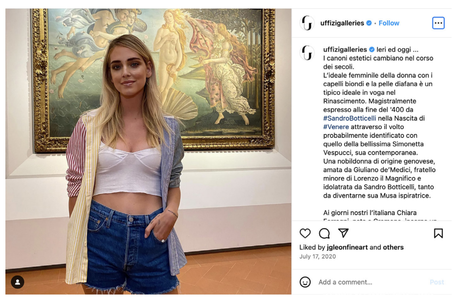
Figure 4. Chiara Ferragni and Botticelli's Venus (post by @uffizigalleries, 17 July 2020)

of gods who govern the world of men but do not belong to it; the latter rather represents an immanent and earthly goddess, namely the tangible manifestation of a cult of the Self that does not look at any otherworldly deity, but finds full fulfilment in the here and now<sup>26</sup> – just as the new cult founded by Massimo in Just Believe invites its believers to do.